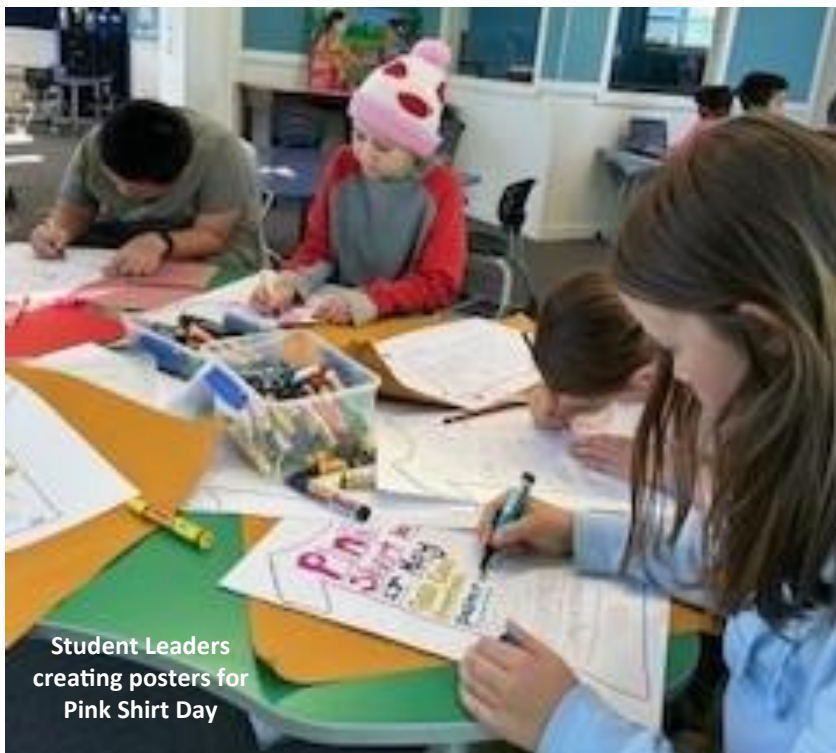
Student Leaders creating posters for Pink Shirt Day

A reminder will be sent out over the school app later in the week.